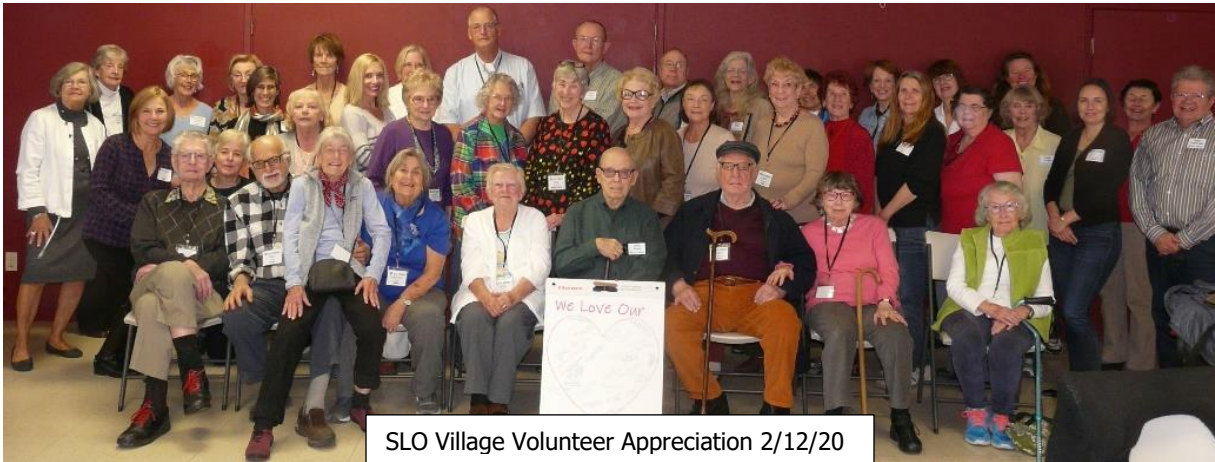
SLO Village Volunteer Appreciation 2/12/20

Housing has been his most critical need, especially as the pandemic spread. He was able to take over the lease for an apartment off campus in April when a Cal Poly student returned home after the college closure but lost that opportunity in October. Despite obtaining a low-income subsidized housing voucher, he has been unable to find availability in this high-priced rental market. We are hopeful he will find housing before the worst of the cold and wet weather sets in.